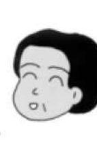
in her 50s