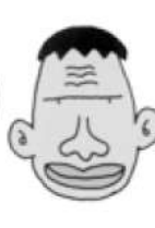
not very good looking